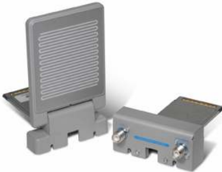
Figure 1. Cisco Aironet 1200 Series Access Points 802.11a Radio Modules

As the popularity of wireless LANs increases, enterprises are installing access points in more types of facilities, locations, and orientations. The Cisco Aironet 1200 Series is designed with this in mind. With its broad operating temperature range and cast-aluminum housing, this device provides the ruggedness required in factories, warehouses, and the most challenging environments. Support for inline power over Ethernet (PoE) and local power maximizes powering option flexibility. The access point and integrated mounting system are designed for installation on walls, below ceilings, and, with its plenum ratable metal case, above suspended ceilings.